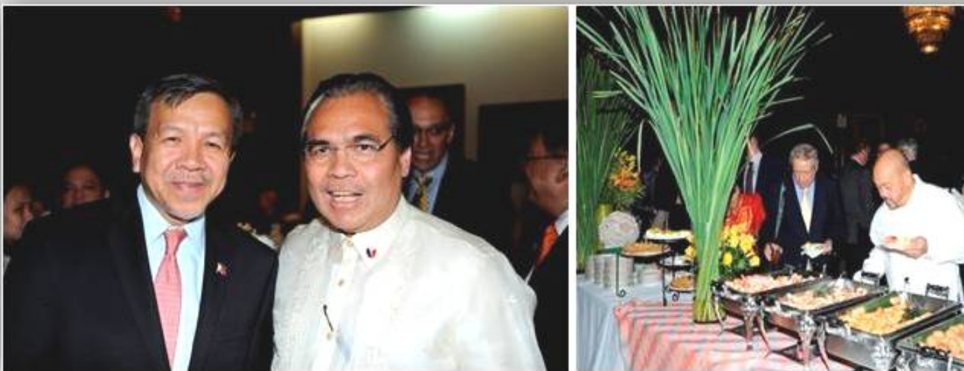
(Left photo) Secretary Domingo with Consul General de Leon; guests participating in the reception. (Right photo) Buffet table during the reception.

File photo of the Philippine National Day Reception and Press Conference at the United Nations, New York, June 14, 2012.