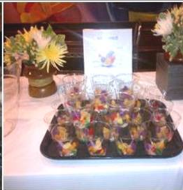
Samples of Philippine delicacies served at the