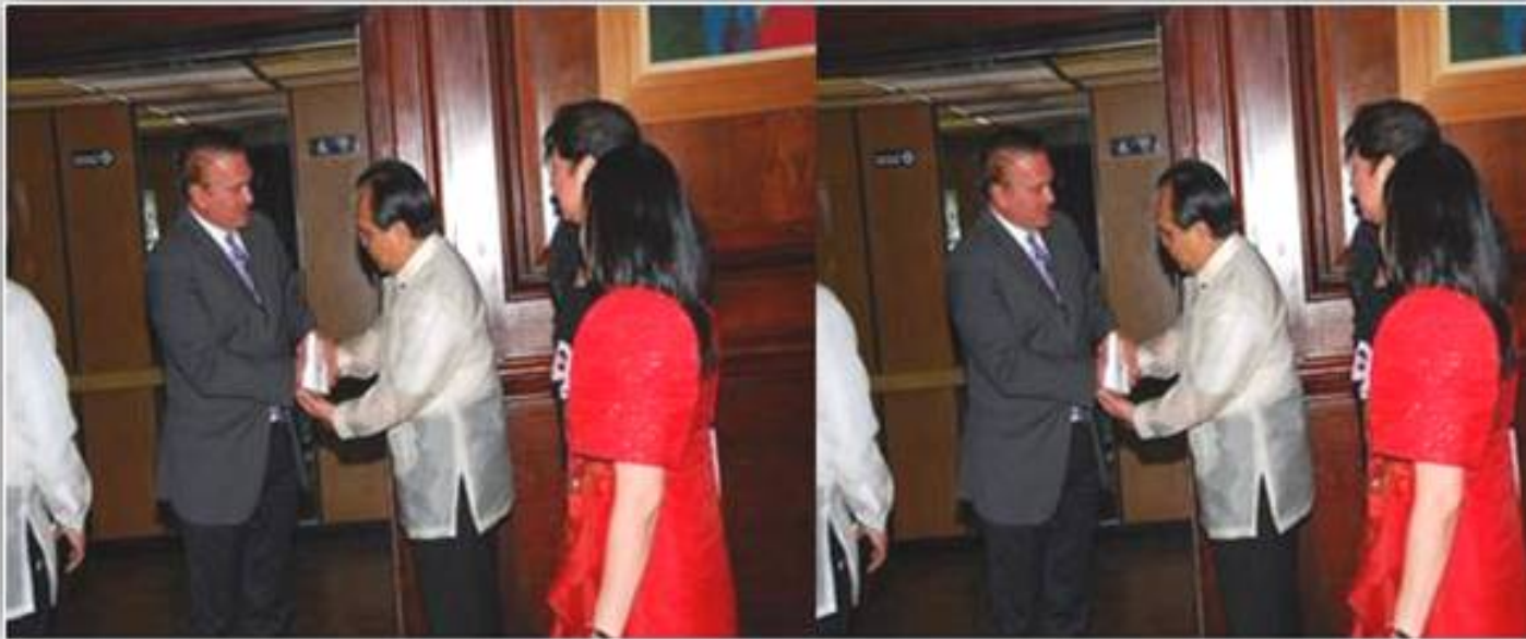
(Photo, from left) Consul General Mario de Leon welcomes the Consul G Africa, and other dignitaries.

14 June 2012 - The Philippine Consulate General in New York (NY) in cooperation with the Philippine Trade and Investments Center-NY (PTIC), Department of Tourism-NY (PDOT-NY), and the Philippine Center hosted a formal reception on June 11, the eve of the 114 th anniversary of the proclamation of Philippine Independence.