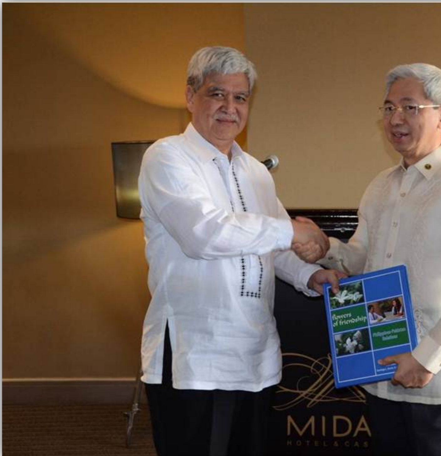
Undersecretary Jesus Yabes turns over copies of “Flowers of Friendship” to UP