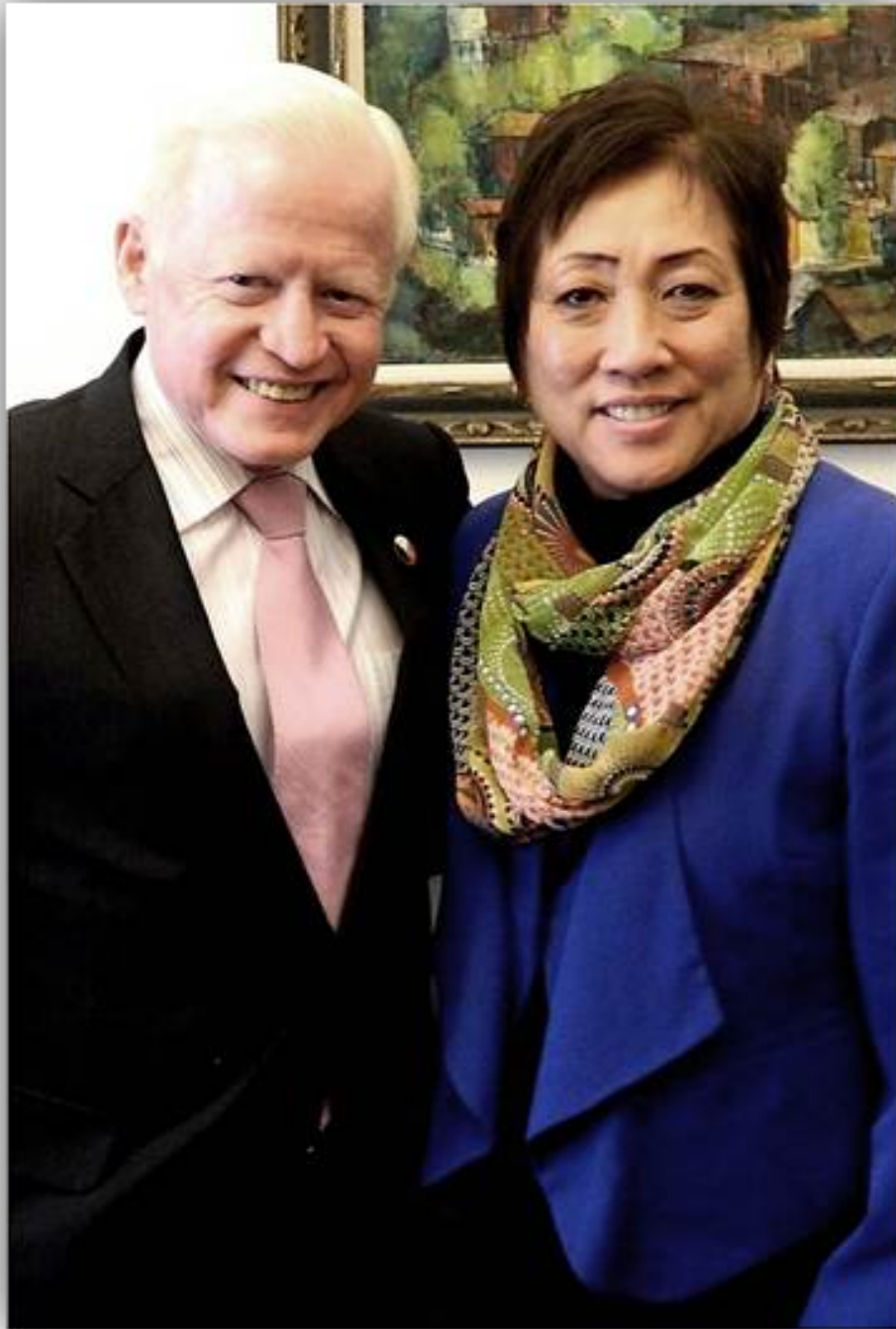
Ambassador Jose L. Cuisia, Jr. with Democratic Rep. Colleen Hanabusa of Hawaii.

The following table shows the number of children in the household for each age group in the United States.